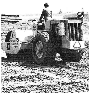
Excavator levels the ground for new building.

The larger the island of knowledge, the longer the shoreline of wonder.