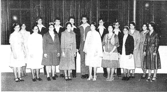
After a long day of sight-seeing, seniors make an attempt to pose for a picture in the Kennedy Center.