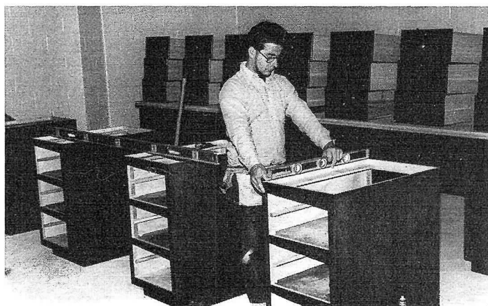
Leveling up cabinets in the new science room.

basic safety features including fire alarms, fire extinguishers, lighted exit signs, and other related items.