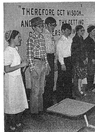
Student Council models the dress code for Spirit Week.