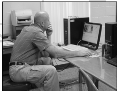
Checking the news before class begins