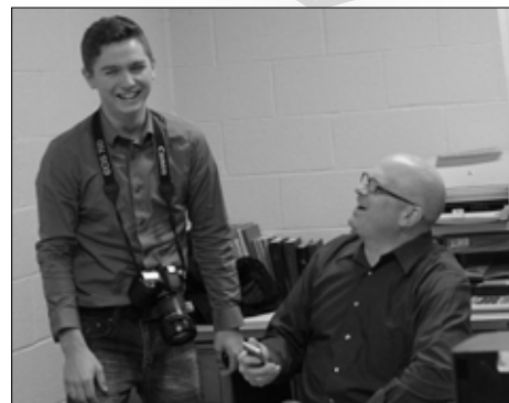
A typical scene in room 109